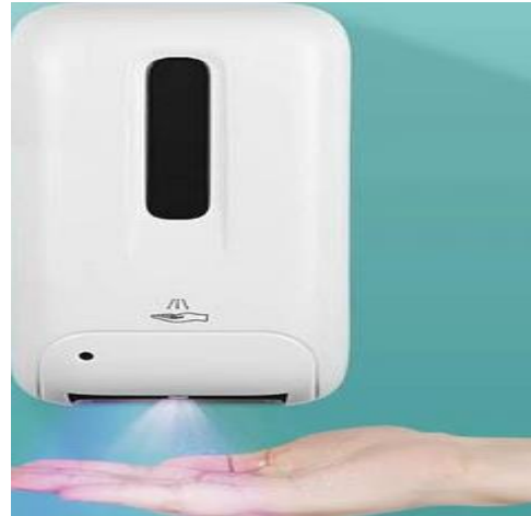
Sensored Alcohol Dispenser