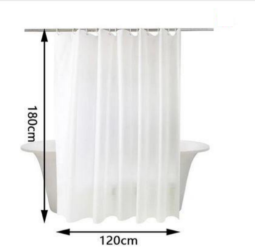
Shower curtain plain white