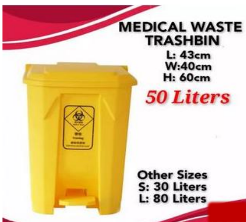
Disposable waste bin for sharp object