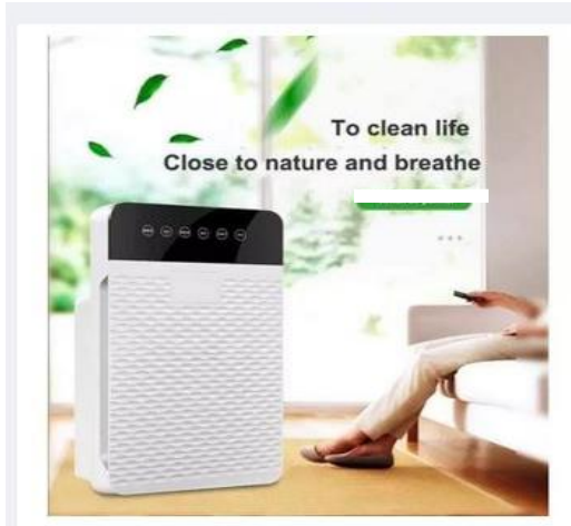
Air Purifier w/remote control hepa filter