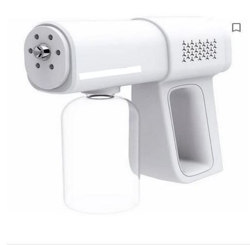
Alcohol Spray Gun