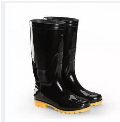
Boots (size 7,8,9)